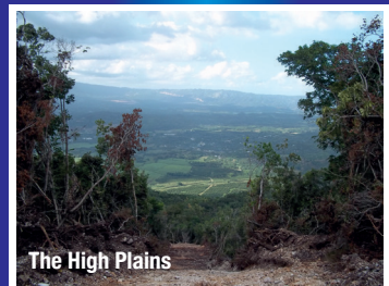
The High Plains